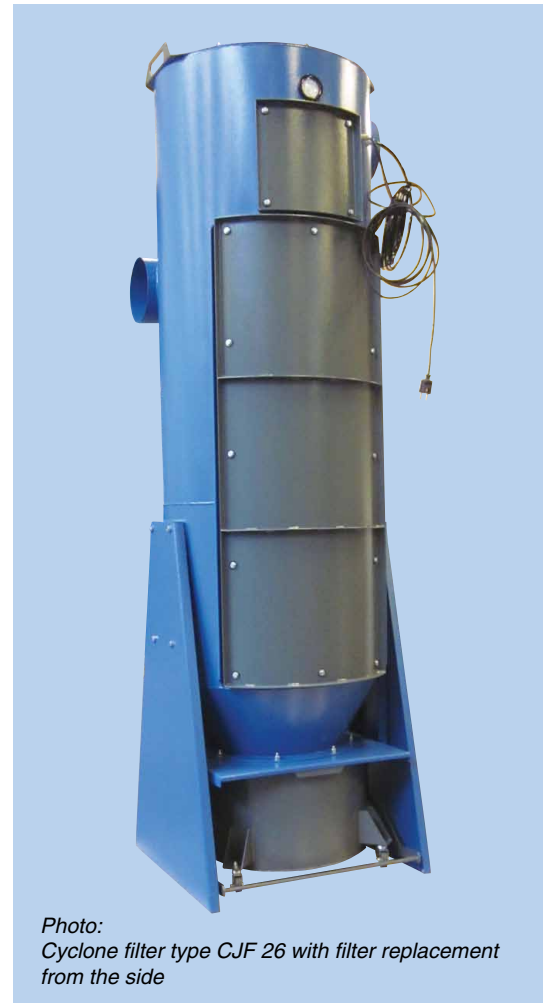
Photo: Cyclone filter type CJF 26 with filter replacement from the side

* Note: Unit height is increased by 330mm